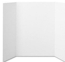
Table top = W 120cm x 80 cm